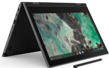
Acer Chromebook Spin R753TN $564.80